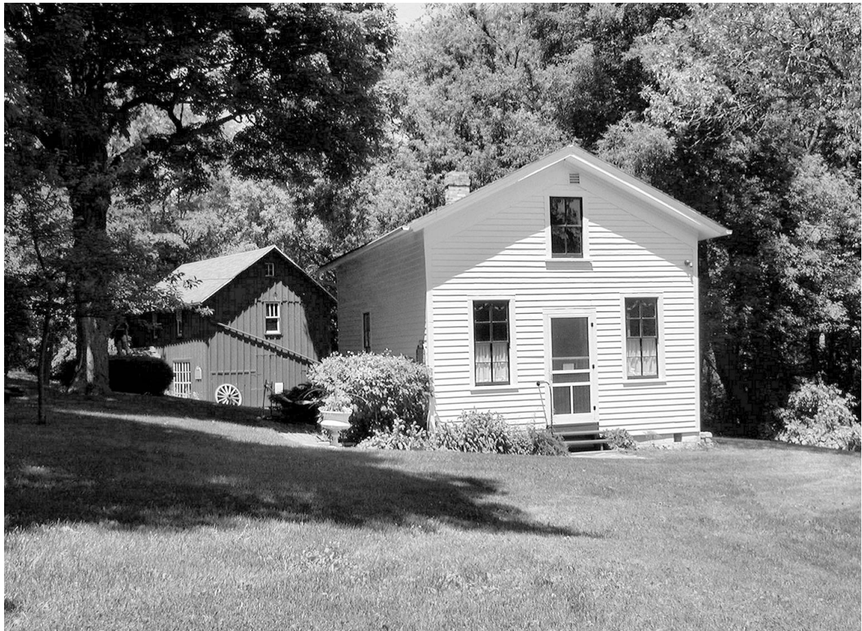
Pioneer Barn in background, near America's First Kindergarten, on Octagon House museum grounds. A gift of Harry and Caroline Moore, it was moved in 1963 and restored. It is now principally used as an implement museum.